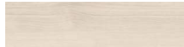
A02605 NORDIC WASH