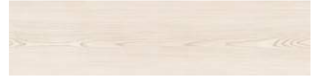
A02602 CHIFFON OAK