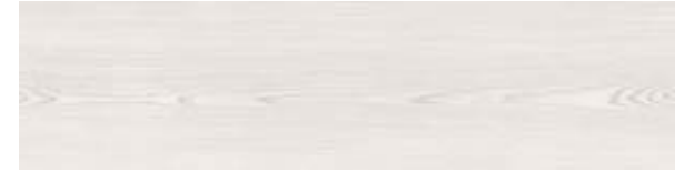
A02601 GLAZED OAK