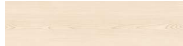
A02603 BARE OAK