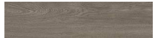
A02612 DARK SATIN