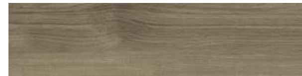
A02607 DARK WASH