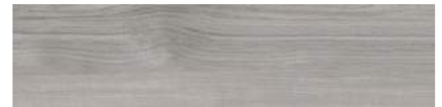
A02608 GREY WASH