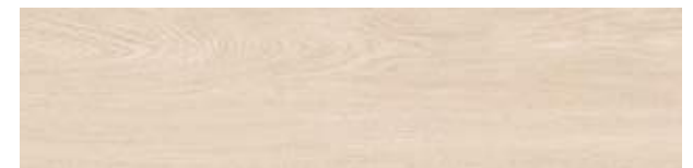
A02610 NATURAL SATIN