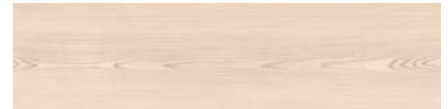
A02604 DRIED OAK