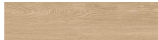
A02611 OAK SATIN