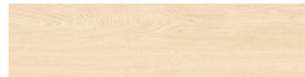
A02609 AGED SATIN