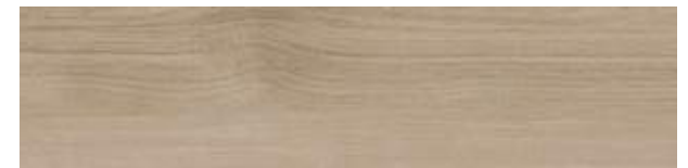
A02606 ANTIQUE WASH